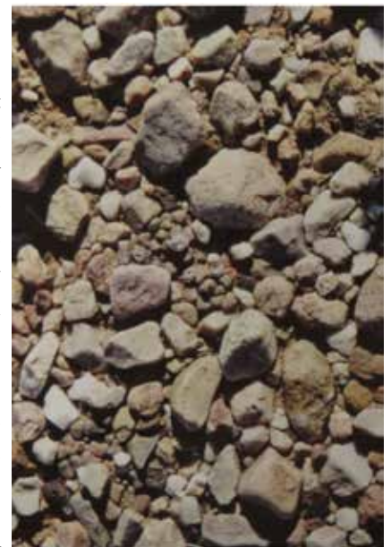
S. Hammer-Mesembs: The Titanopsus Group

Cultivation: Alainopsis schooneesii is a relatively easy to grow and quick to flower Mesembs. A deeper pot with rocky and sandy substrate to provide excellent drainage is recommended to accommodate the thick tuberous root. Although in nature the taproots are usually all hidden under ground, in cultivation, the plant can be gradually raised above the ground to reveal some of