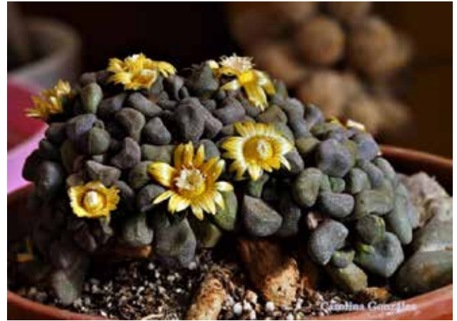
Steven Hammer-Mesembs: The Titanopsis Group

the roots when it is potted up to create a “bonsai” look. They are winter growing, summer dormant in Houston. The thick leaves and taproots make this plant very drought tolerant, but they seem to be very forgiving about a bit of over or under watering, especially during their growing season. This plant will prefer full sun to part sun from fall to spring with adequate watering (allow potting media to dry out before you water again in Houston), but it should be protected from excessive heat and sun in summer dormancy with restricted watering. A. schoonesii is very cold resistant. It will not be harm by Houston winter temperatures with a rain cover. In summer, you need a shade cloth underneath the rain cover with excellent ventilation.